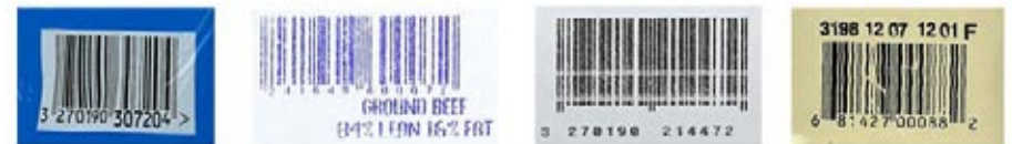
Samples of "Hard to Read" and Damaged Bar Codes

Magellan® FirstStrike® decoding firmware, part of the next generation OmegaTek™ Productivity Technology, provides a higher read rate of truncated and hard-to-read labels including high performance on GS1 DataBar™ codes (RSS).