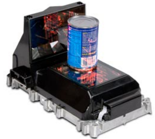
Photo Shows the New Magellan® 8400/8300 Compact, Sealed Scan Engine

Based on an innovative design, the patented Magellan® 8400/8300 uses a single motor. While exceeding the performance of other scanners, this design also reduces failures due to its lower speed and reduced power consumption. In addition, a very compact sealed scan engine provides better protection from dust, debris and liquids.