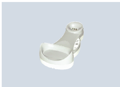
OM - Gryphon™ / C-Gryphon™