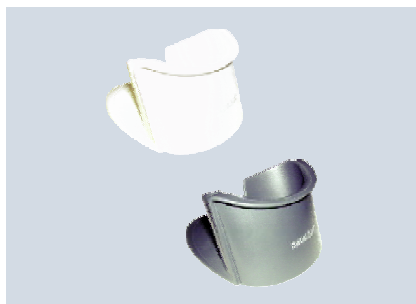
Gryphon™ Desk / Wall holders