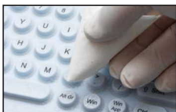
Easy to wipe down