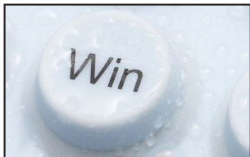
No infection traps